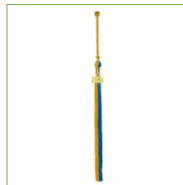
Memory Tassel 13 00 Quantity: Each