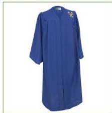
Cap, Gown, & Tassel 55 50 Unit Quantity: 1 Unit